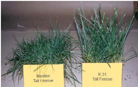
The clear difference between a soft-leaved tall fescue (Barolex, left) compared to Kentucky-31 (right).

Tall fescue is a widely adapted cool season grass. In the transition zone, tall fescue is used extensively due to its superior summer production. Now there is a new generation of tall fescue available. They are soft-leaved tall fescues. The picture below clearly shows the difference between a soft-leaved tall fescue and Kentucky-31. The Kentucky-31 leaves are wide, open, rough and upright. The Barolex is fine-leaved, soft and very dense. This picture was taken 5 months after planting side by side.